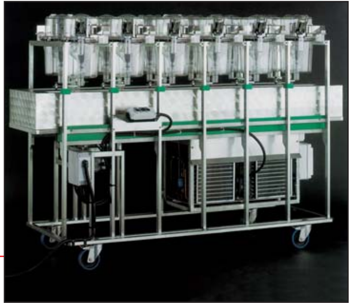
3M12B940 Refrigerated collection rack for 12 cages