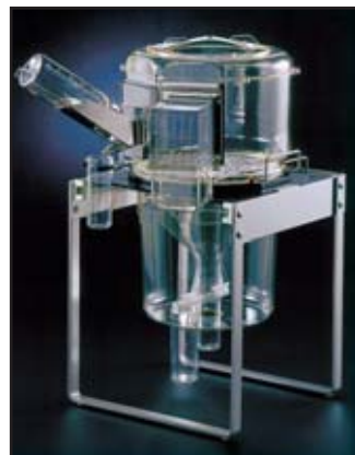
3701M081 - Metabolic cages for rats over 300g.