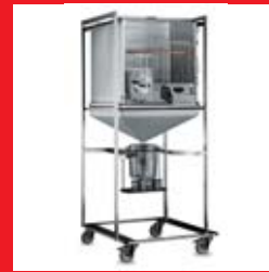
Metabolic Cage for Marmosets. Compliant with ETS123 and UK directives.