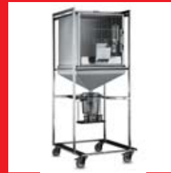
Metabolic Cage for Rabbits. Compliant with ETS123 and UK directives.

To maximise operational efficiency and learn more about these products contact your local representative.