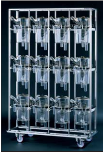
3M12D100 Vertical type rack for 12 cages