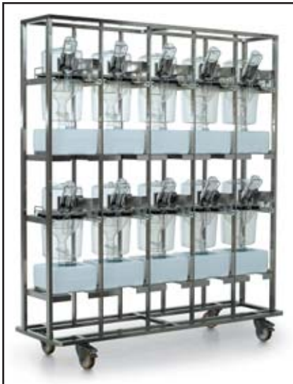
3M10B100UC Rack for 10 cages 3700M002UC (metabolic and diuresis cage collection chiller)