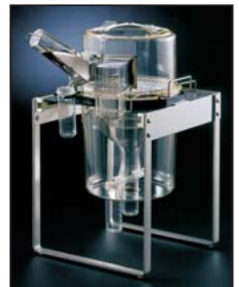
3700M061 - Metabolic cage for rats under 150g. 3700M071 - Metabolic cage for rats from 150g to 300g.