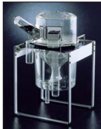
3700M022 - Metabolic cage for mice with double chamber feeder.