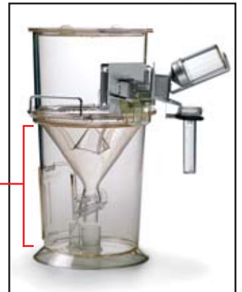
3600M021 - Metabolic cage for mice with single chamber feeder.

Special design of the funnel and of the separation cone.