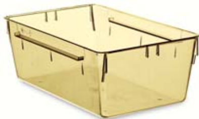
H-TEMP Polysulfone (PSU)